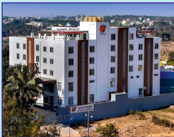
# 225, Behind Tata Motors, Arishinakunte, Off Tumkur Road, Nelamangala, Bangalore - 562 123. www.jupiterhospitalnel.com

Our Jupiter Hospital, Malleswaram is a 100 bedded multi speciality hospital located in Malleswaram. It was established in 1997. It has over 50 reputed consultants in its panel. With our new 100 bedded multi speciality Jupiter Hospitals in Nelamangala (NABH accredited) a total of 200 bedded clinical facilities are made available to all our students. The new hospital has a fully equipped modern diagnostic 24x7 Laboratory and other facilities like x-ray, ultrasound, uroflowmetry, stress ECG, (TMT) Endoscopy, Laparoscopy, Physiotherapy, Dialysis and even Digital Subtraction Angiogram (DSA). It also has ICU & NICU facility, minor and major operation theaters and labour theaters with latest equipments. A modern Fertility Center is a unique feature of our New Hospital