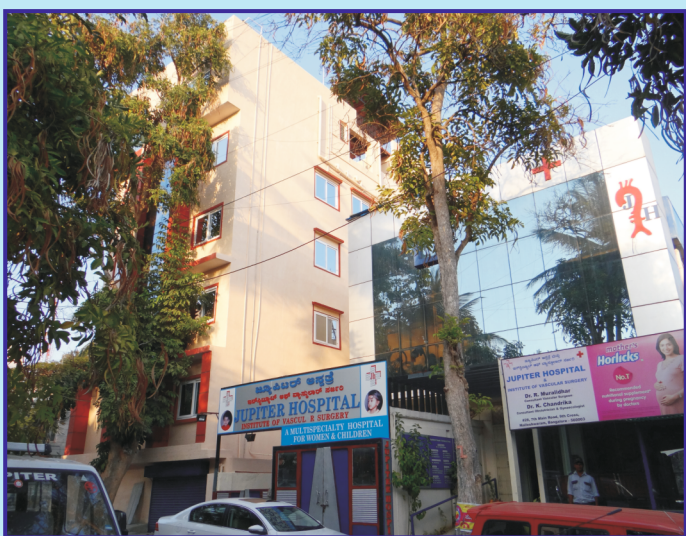
# 28, 7th Main, 9th Cross, Malleswaram, Bangalore-560 003. www.jupiterhospitalbangalore.com